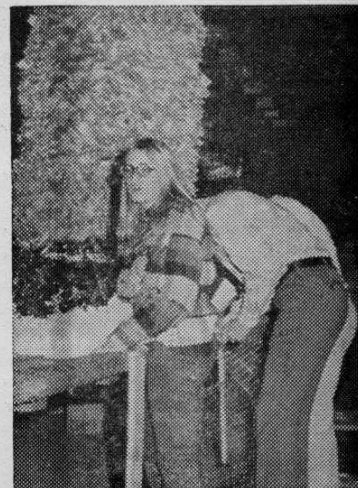
Sophs Construct Float

Top honors for the classes in float competition went to this year's Senior Class. With "Puff the Magic Dragon," the class of 1972 took its second consecutive first place finish. The general theme of the parade was "Songs of the Century."