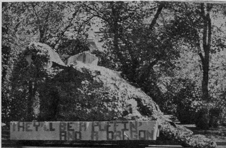
Senior Float Captures First Place