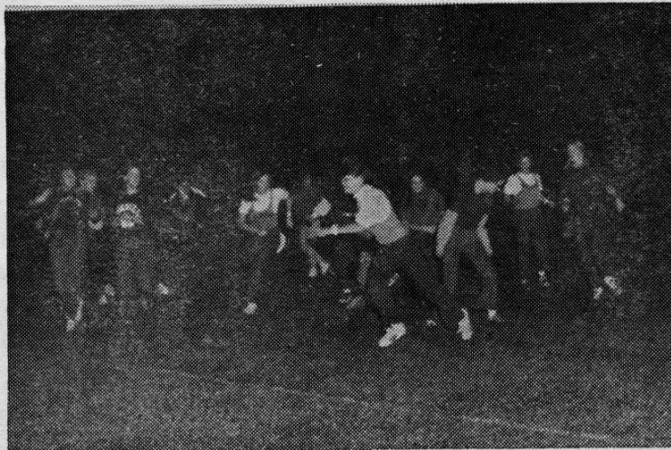
Action Is Fast In Powder Puff Game