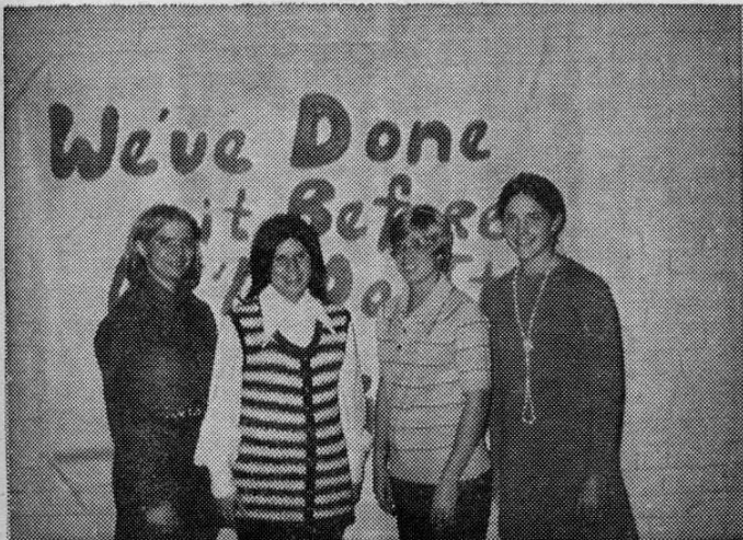
New RHS 'A' Basketball Cheerleaders