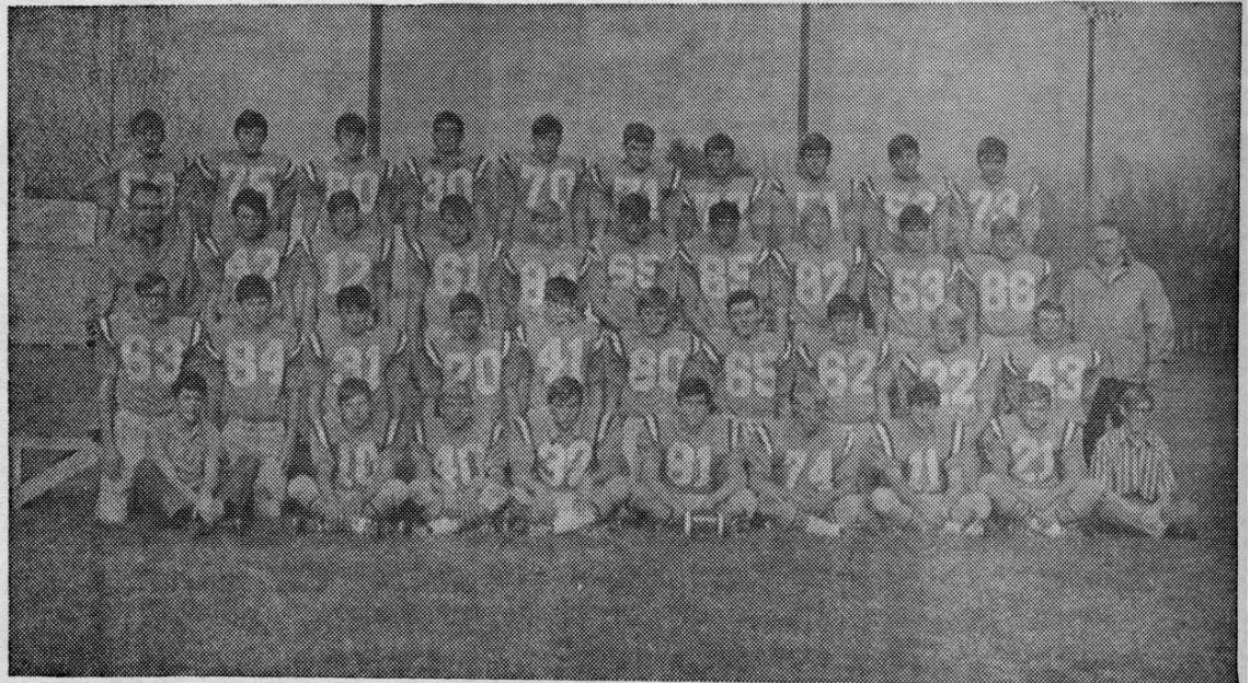
Pheasants Close Out Football Season